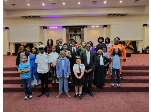
Pictured above are the participants from the Black History Program held in February. They were from the Anointed Kids Ministry and the MPAC Youth Ministries